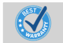
BEST WARRANTY IN THE INDUSTRY