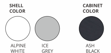
SHELL COLOR ALPINE WHITE